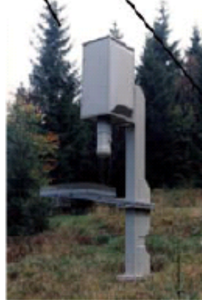
LOCAL MONITORING DATA; AIRBORNE GAMMA SPECTROMETRIC MEASUREMENTS