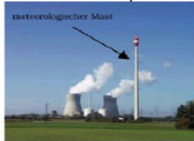
SITE AND PLANT DATA OF EUROPEAN NPPs; SOURCE TERM DATA BASE; EMISSION DATA; LOCAL METEOROLOGY